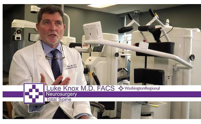
YourHealth Today on KNWA

Faith in Action received funding from individuals and organizations to provide nearly 4,000 free nonmedical services to 100 homebound older adults who lack a local support system. Last year Faith in Action volunteers spent 3,580 hours with their clients and drove 28,700 miles to provide them with a service or friendly companionship.